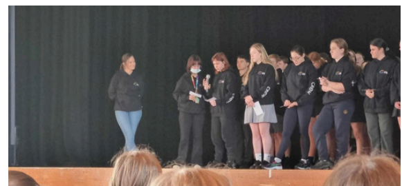
Our Live 4 Life Crew did an amazing job today.