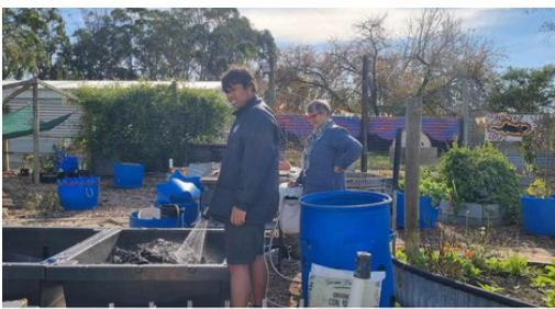
Making the most of the beautiful weather, working in the garden.