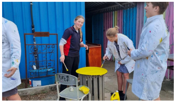
Heywood District Secondary College offered an array of thrilling activities last week!