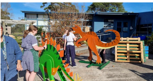
Our year 7's recycling the props from our wood, wine & roses float to decorate our garden.